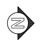
1 2ND/3RD FLOOR PLAN SCALE: 1/4" = 1'-0"

NOTE: PROVIDE TILE FLOOR PER OWNER SELECTION @ WASHER / DRYER CLOSETS - TYP.